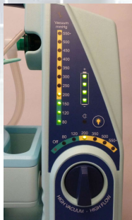
Clear digital display with single large vacuum control knob