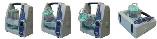
The SAM e.p.s - Revolutionary in design