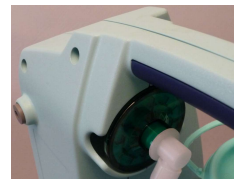
Easy release Hydrophobic filter and 'softgrip' carry handle.