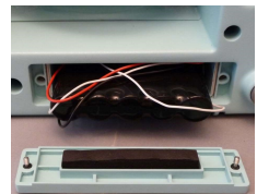
Simple battery replacement