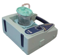
Rotating bottle for stable positioning on uneven surfaces