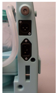
Internal onboard charger capable of running directly from AC and DC supplies.