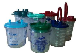
Cradle support for MGE reusable cannisters and various liner systems including Serres, Vacsax, Cardinal Health, FloVac, MTP and others.