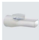
Mouthpiece with valve