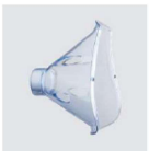
Adult Face Mask