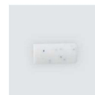
Porex Filter (fitted)