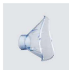
Child Face Mask