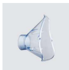
Child Face Mask