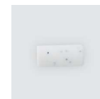
Porex Filter (fitted)