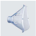
Adult Face Mask