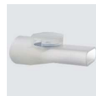
Mouthpiece with valve